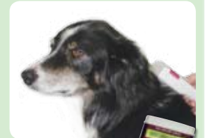
A special scanner is used to "read" the unique I.D code. This code speedily identifies your pet.