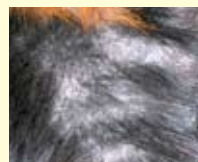
Typical crusting lesions

We are here to help! If you would like any further information on any aspect of guinea pig care, or a check-up for your pet, please contact us!