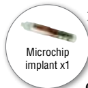
Microchip implant x1